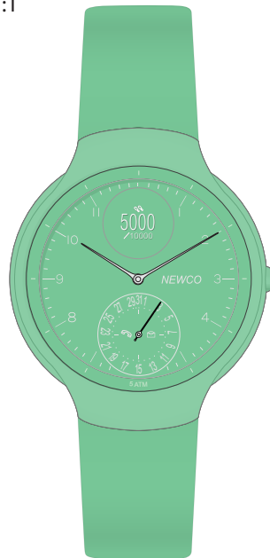
19-049G P 77