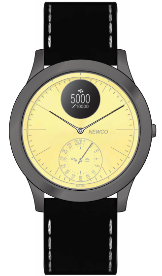
19 300A S 32