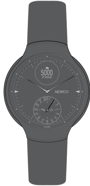
19-049G P 35