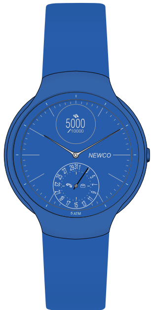
19-049G P 55