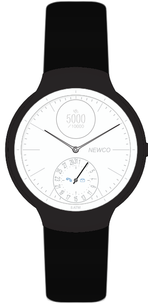
19-049G P 30