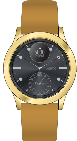
19 300A S 26