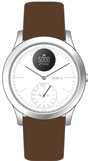
19 300A S 16