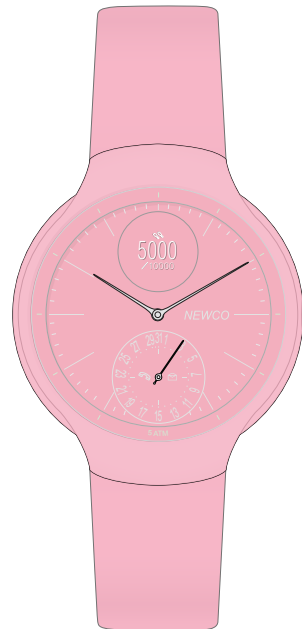
19-049G P 60