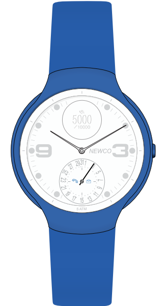
19-049G P 50