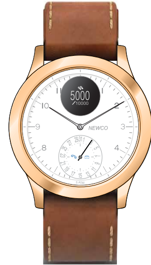
19 300A S 20