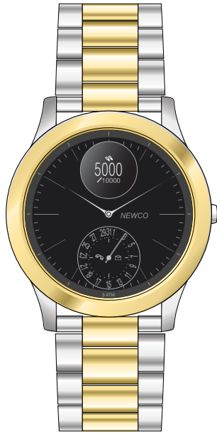
19 300A S 12