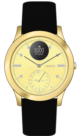
19 300A S 21