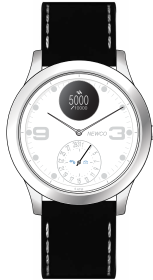
19 300A S 13