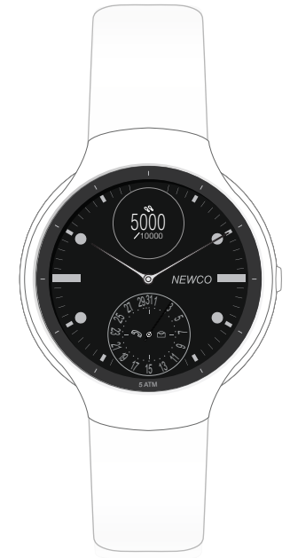
19-049G P 01