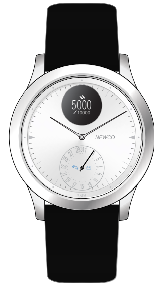
19 300A S 11