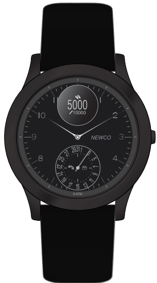
19 300A S 22