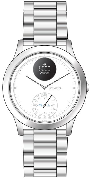
19 300A S 10