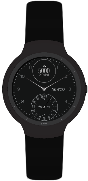
19-049G P 33