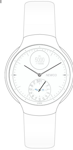
19-049G P 00