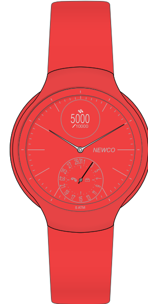
19-049G P 66